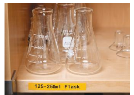
General lab equipment labels