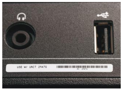
High resistant labels