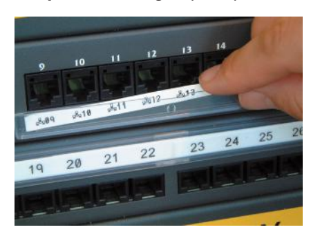
Punch block & patch panel labels