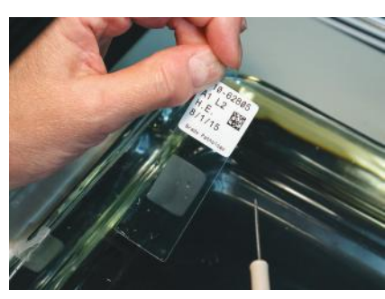
Labels that resist moisture, water baths and autoclave temperatures