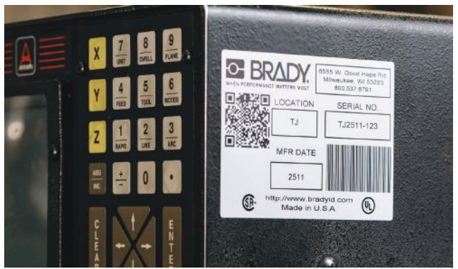
Rating & name plate labels