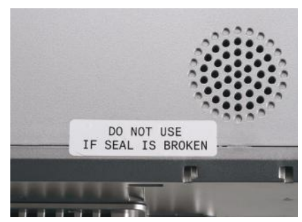
Security identification labels