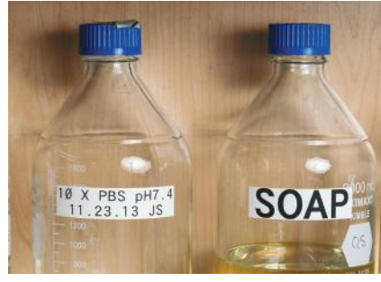
Removable labels for glassware