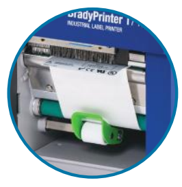
Peel & Present Accessory