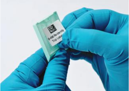
Tissue cassette labels